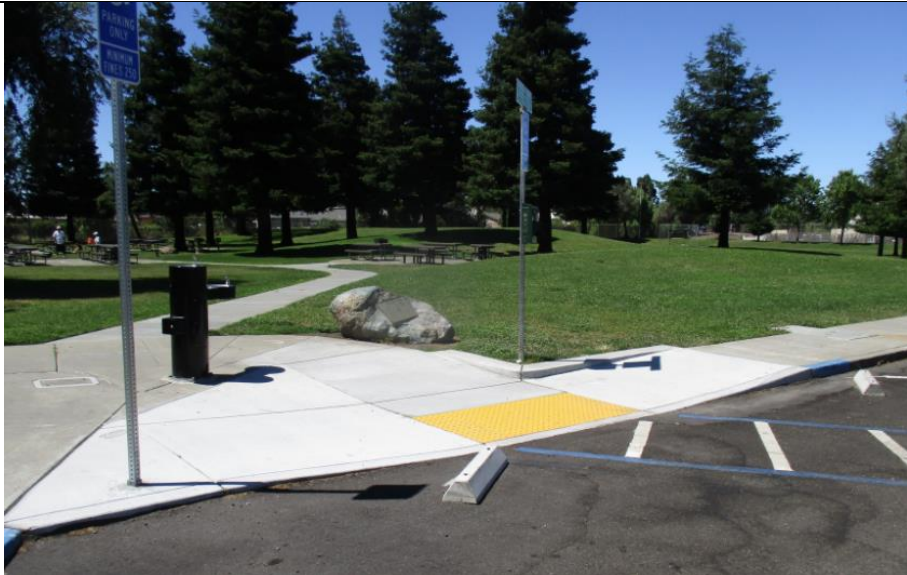
COMPLETED ACCESSIBLE CURB RAMP AT BONAIR PARK

ANNUAL STREET SEALING 2017-18, PROJECT NO. 2018.0070