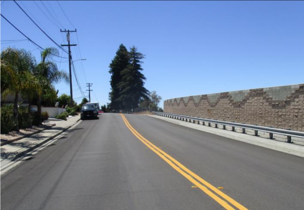
COMPLETED CAPE SEAL ON BENEDICT DRIVE

ANNUAL STREET SEALING 2017-18, PROJECT NO. 2018.0070