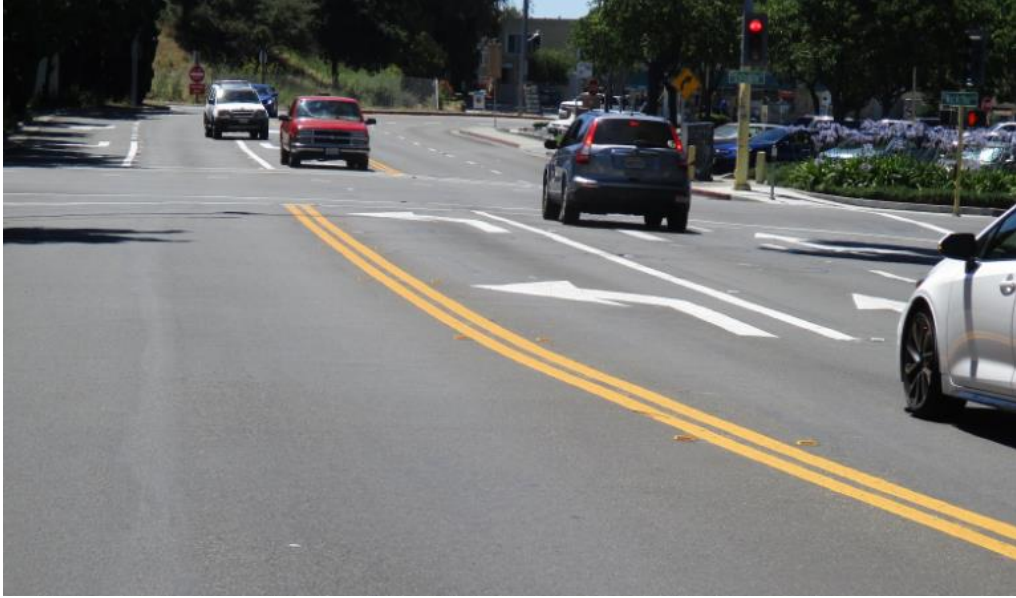
COMPLETED CAPE SEAL AT MACARTHUR/ESTUDILLO INTERSECTION