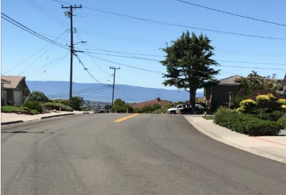
COMPLETED SLURRY SEAL ON MARINEVIEW DRIVE